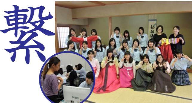
We have a homeroom on Thursday at the seventh period.

C You can deepen your knowledge of foreign languages and learn various cultures.