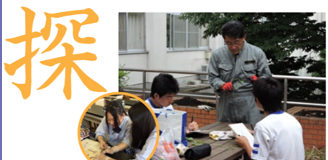
We have a homeroom on Thursday at the seventh period.

D You can deepen your knowledge of math and science. Also, you can learn a natural environment in Chita city through a field work.