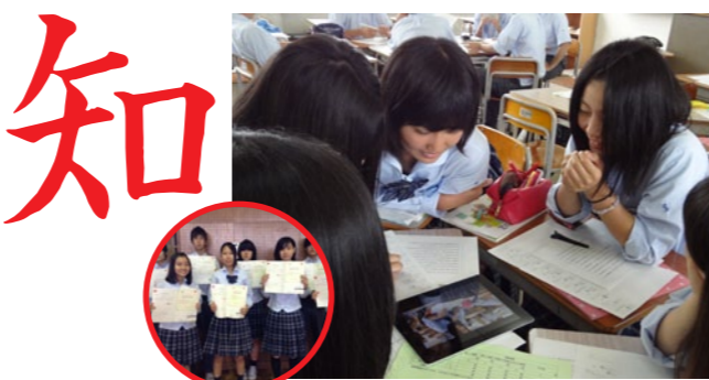
We have a homeroom on Thursday at the seventh period.

A You can deepen your knowledge of literature, history, politics and economy and foreign language.