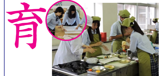
We have a homeroom on Thursday at the seventh period.

G You can deepen your knowledge of nutrition education, upbringing, nursing care. You can also learn an aging society.