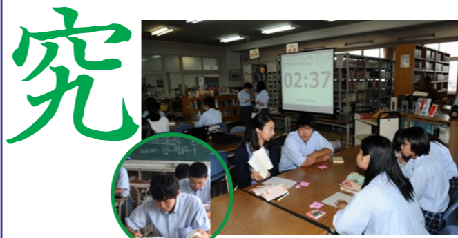
We have a homeroom on Thursday at the seventh period.

B You can deepen your knowledge of math and science.