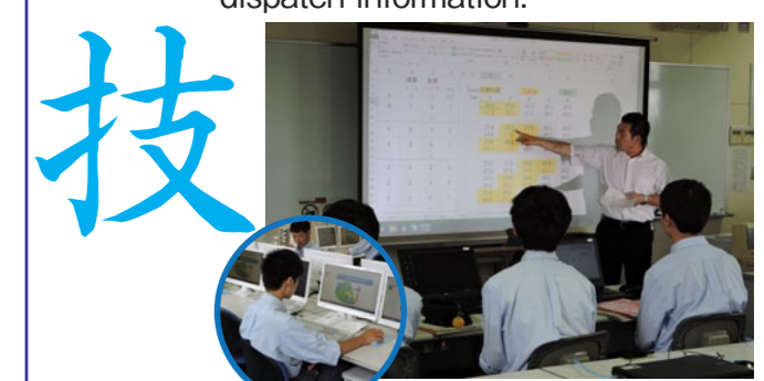
We have a homeroom on Thursday at the seventh period.

F You can master skills of a computer. You can also improve your ability of dispatch information.